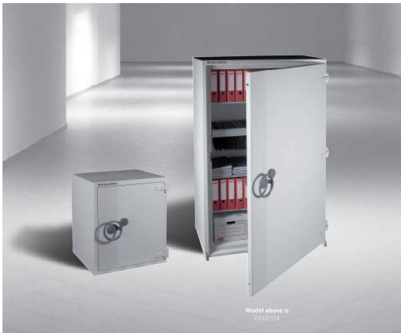
Model above is P352/354